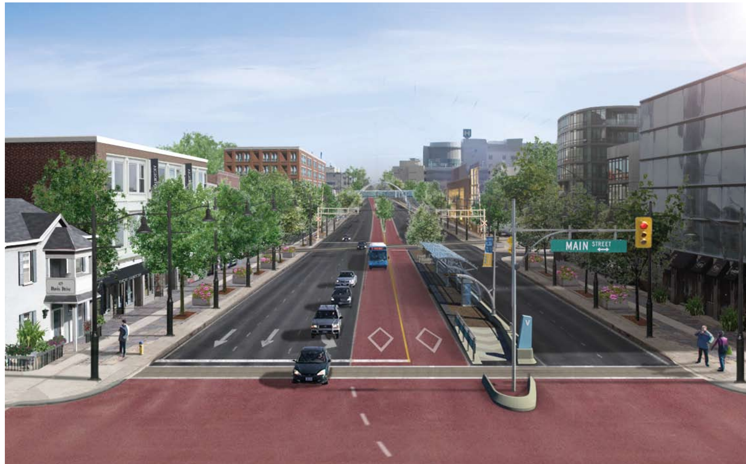
Rapid Transit bus lanes offer significant development opportunities through intensification.